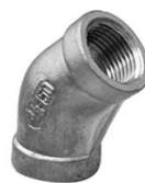
Size 1/8" - 4"