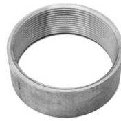
Size 1/8" - 6"