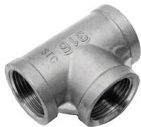
Size 1/8" - 4"