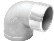
Size 1/8" - 4"