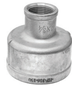
Size 1/4" x 1/8" - 4" x 3"