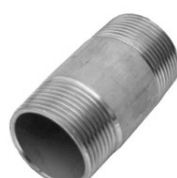
Size 1/8" - 6"