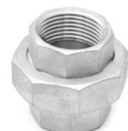
Size 1/8" - 4"