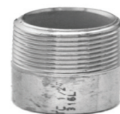
Size 1/8" - 6"