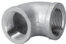
Size 1/8" - 4"