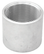
Size 1/8" - 6"