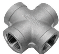
Size 1/8" - 3"